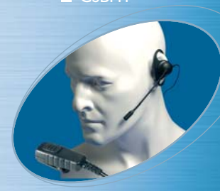
■ EA19/750 ▲ EA19/950