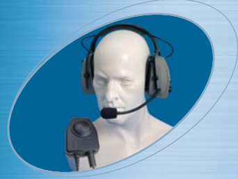
■ CHP750D ▲ CHP950D