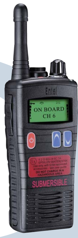
Pictured: UHF ATEX variant with stubby antenna

Zone 2 covers areas where the environment is only rarely hazardous, and then only for brief periods.