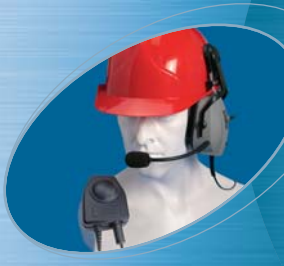
■ CHP750HS ▲ CHP950HS

*Used to charge ATEX models in a non hazardous-environment