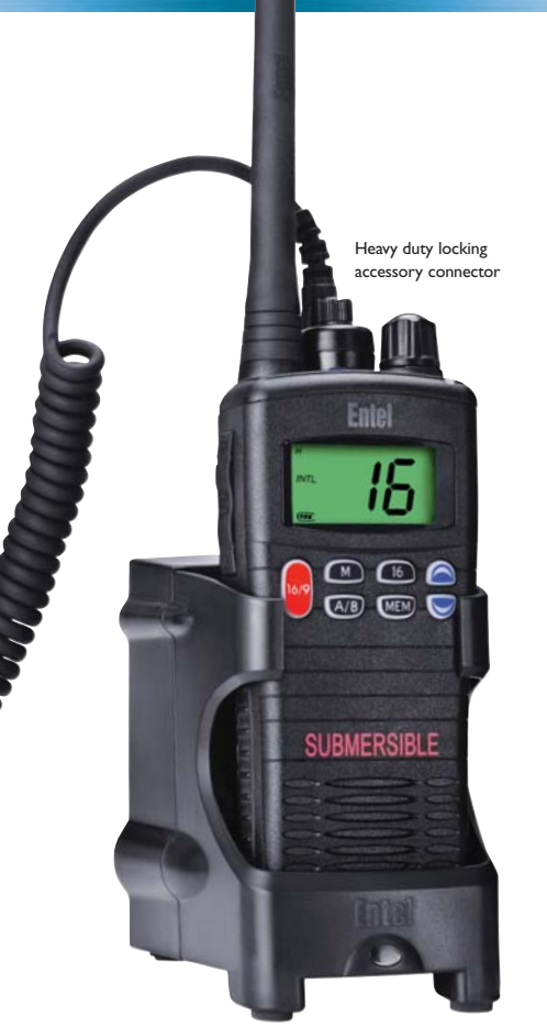
Pictured: Radio with optional CSAHT rapid charger

HT Marine Series 2.0 – superseding the multi award-winning HT series 1.0 is a challenging task considering its success with fire brigades, petrochem, shipping and major blue chip organisations worldwide. Version 2.0 builds upon this success with a wider range of models to suit every application from simple to advanced. Built to last, the HT Series 2.0 is designed to endure the every day rigours of life at sea.